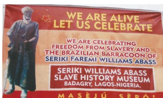
A Poster commemorating the Abolition of Slave Trade in Badagry.