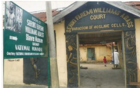
Entrance to the Seriki William Abass Baracoon of 40 Slaves, Badagry.

of the trans-Atlantic Slave Trade. These slaves also cut across many sociocultural strata of the ancient societies: some are criminals serving time in prison, some are innocent people captured on their farms, while some others were prisoners of war. Whatever their circumstance, once they were captured, they were taken to Europe, Brazil and the United States of America and the New World through the Point of No Return. The Vlekete Market in Badagry was a booming market and trade centre for slaves captured in the West coast during the time and was a few hundred metres from the Baracoon.